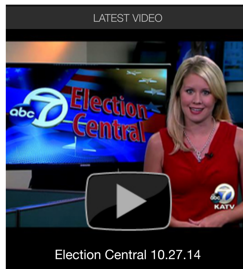
Election Central 10.27.14